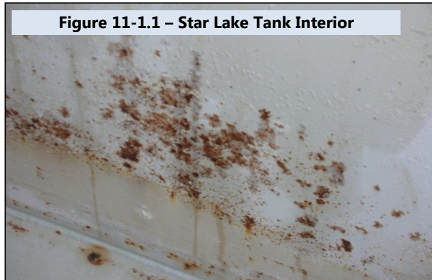
Figure 11-1.1 – Star Lake Tank Interior

The Star Lake Tank is a 2.5 MG standpipe that provides storage for the 560 pressure zone in the southern portion of the District. The North Hill Tank is located at the intersection of S 208th St and 5th Ave S and provides 1.0 MG of storage for the 490 pressure zone. The existing tank coatings are nearing the end of their useful life. The Star Lake Tank Recoat and the North Hill Tank Recoat projects are identified in the 2008 Comprehensive Water Plan as CIP No. 24 and 25,