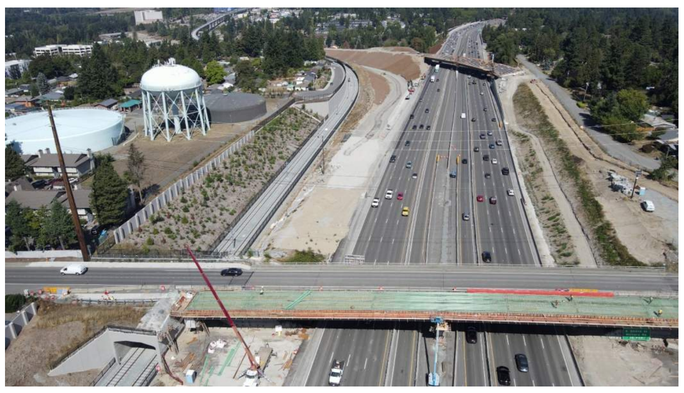
WSDOT SR-509 Completion Project: S 216th Bridge 18" Water Main Crossing