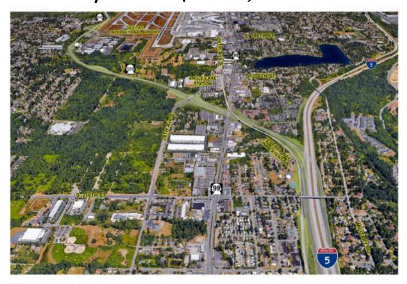
SR 509 After

The Washington State Department of Transportation (WSDOT) proposes to extend the SR509 freeway from S 188th St to Interstate 5 as part of the Connecting Washington and the Puget Sound Gateway projects. Phase 1B will be the first section constructed starting from Kent-Des Moines Road and Interstate 5 and stopping at 24th Ave S in SeaTac. Subsequent phases include extending the road from 24th Ave S through the Tyee Golf Course to S 188<sup>th</sup> St and the existing SR509. WSDOT selected Atkinson Construction to be the Design-Build Contractor for Phase 1B (Interstate 5 to 24<sup>th</sup> Ave S).