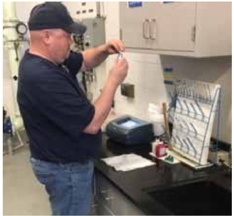
Highline staff sampling water for testing

When your water has been sitting for several hours, you can minimize the potential for lead exposure by flushing your tap for 30 seconds to 2 minutes before