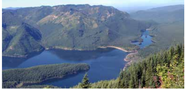
Cedar River Watershed

Your drinking water is tested frequently both by Highline Water District and Seattle Public Utilities to ensure that high quality water is delivered to your home. Last year your drinking water was tested for over 200 compounds and additional contaminants. Tests are done before and after treatment and while your water is in the distribution system.