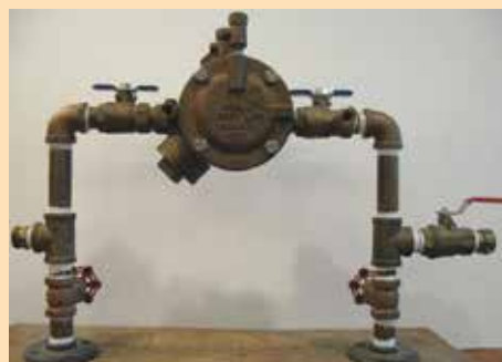
Examples of Backflow Assemblies